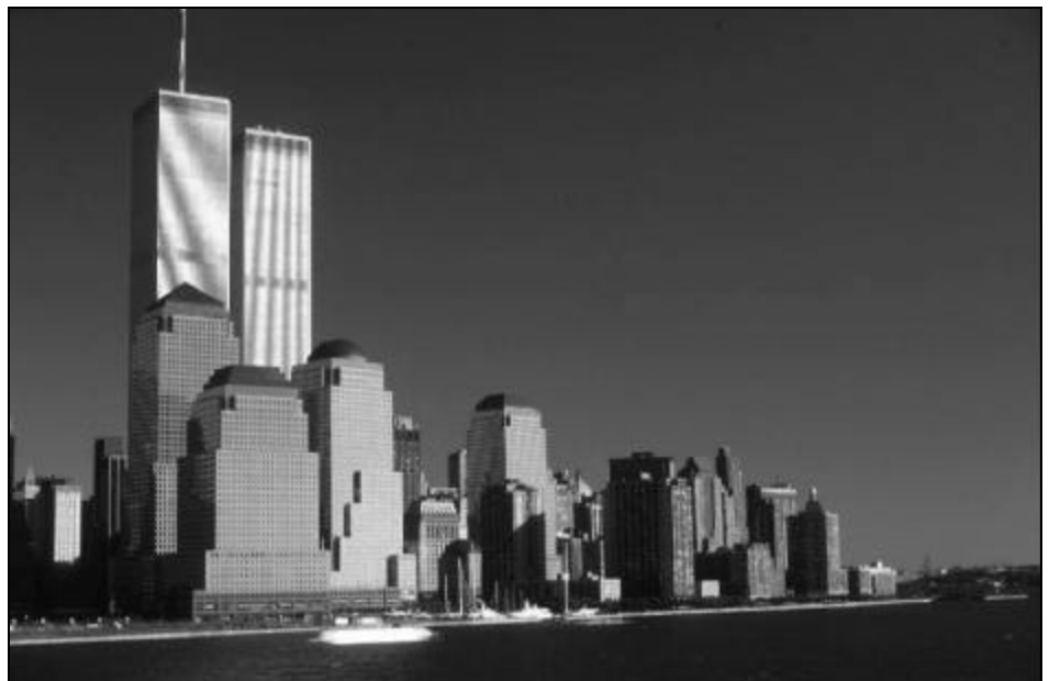
The World Trade Center as it was. A symbol of America's wealth and blessings or an idol of material worship?

God our Father sent His Son to this earth to save us from sin and from the fruit of our lawlessness. God our Father is a just God, a God who loves truth and mercy and humble obedience to Him, not for His benefit, but for ours.